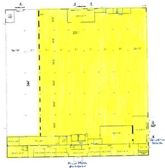
Option #2 40,000 sf