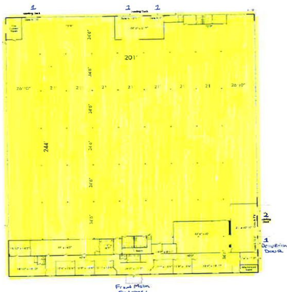
Option #1 50,000 sf