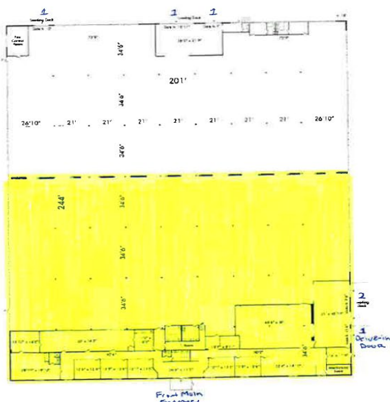
Option #3 29,000 sf