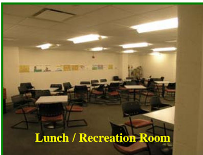
Lunch / Recreation Room