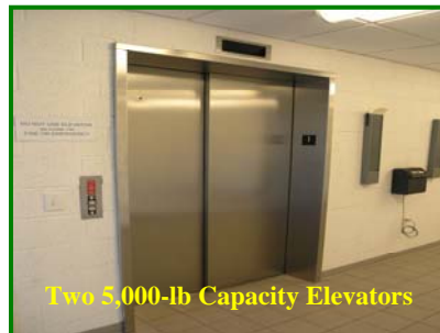
Two 5,000-lb Capacity Elevators