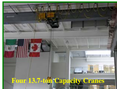
Four 13.7-ton Capacity Cranes