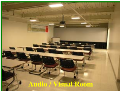
Audio / Visual Room