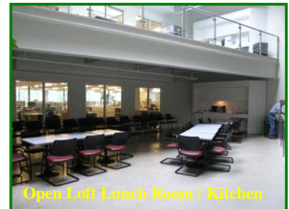
Open Loft Lunch Room / Kitchen